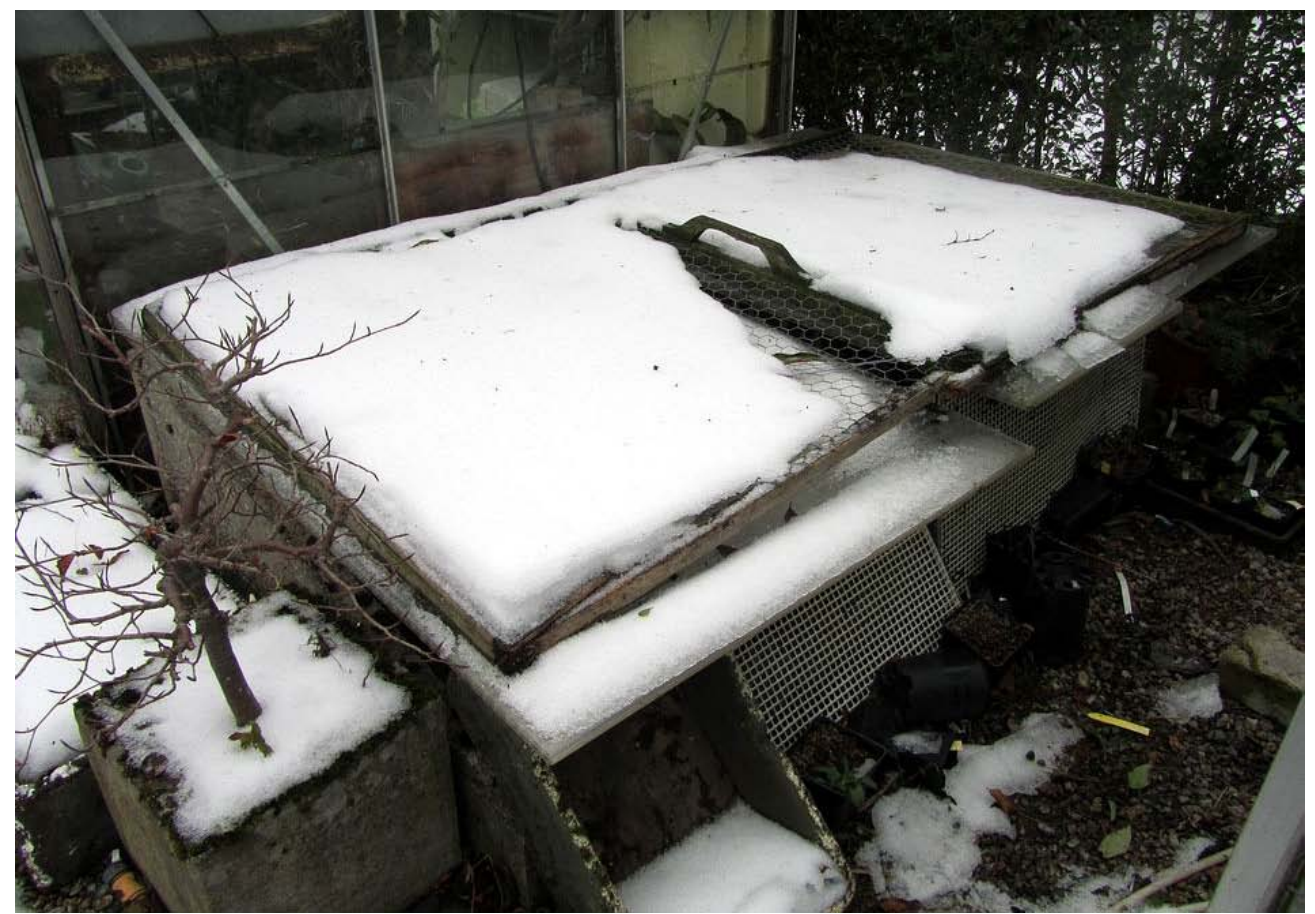
I know there will be more shoots in this outside frame but it is frozen shut and best left like that until the thaw comes - then I can see what is awakening in the pots below this frozen blanket.