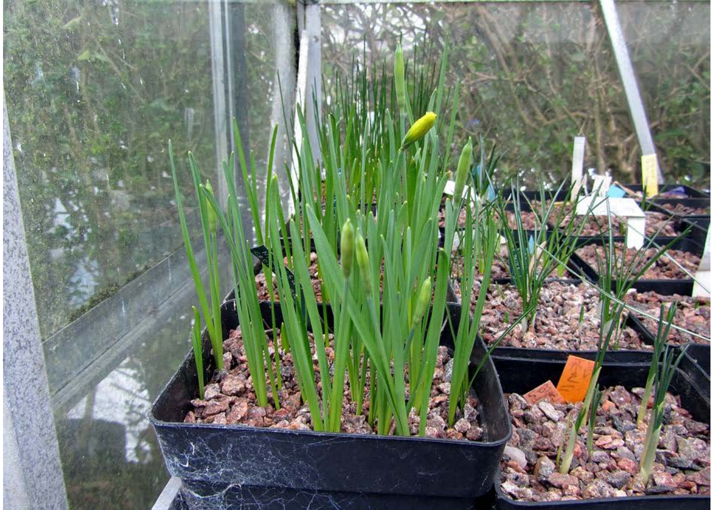
Narcissus 'Cedric Morris' has reverted to the flowering time I was used to some twelve years ago when the flowers never opened before February. For all the years I have written the Bulb Log the first of its flowers have opened by December if not in late November. There are no signs at all yet of the two clumps that are in the open garden.