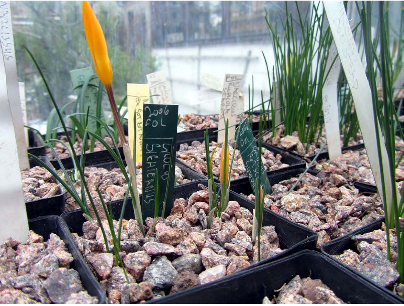
Another pot of Crocus sieheanus seedlings come into flower for the first time and like the one I showed a few weeks ago I will have to confirm the identity from the corm tunic when I repot them.

The next stage if the rate of increase stays the same will be to plant a few outside in the open garden – probably in one of my sand beds.