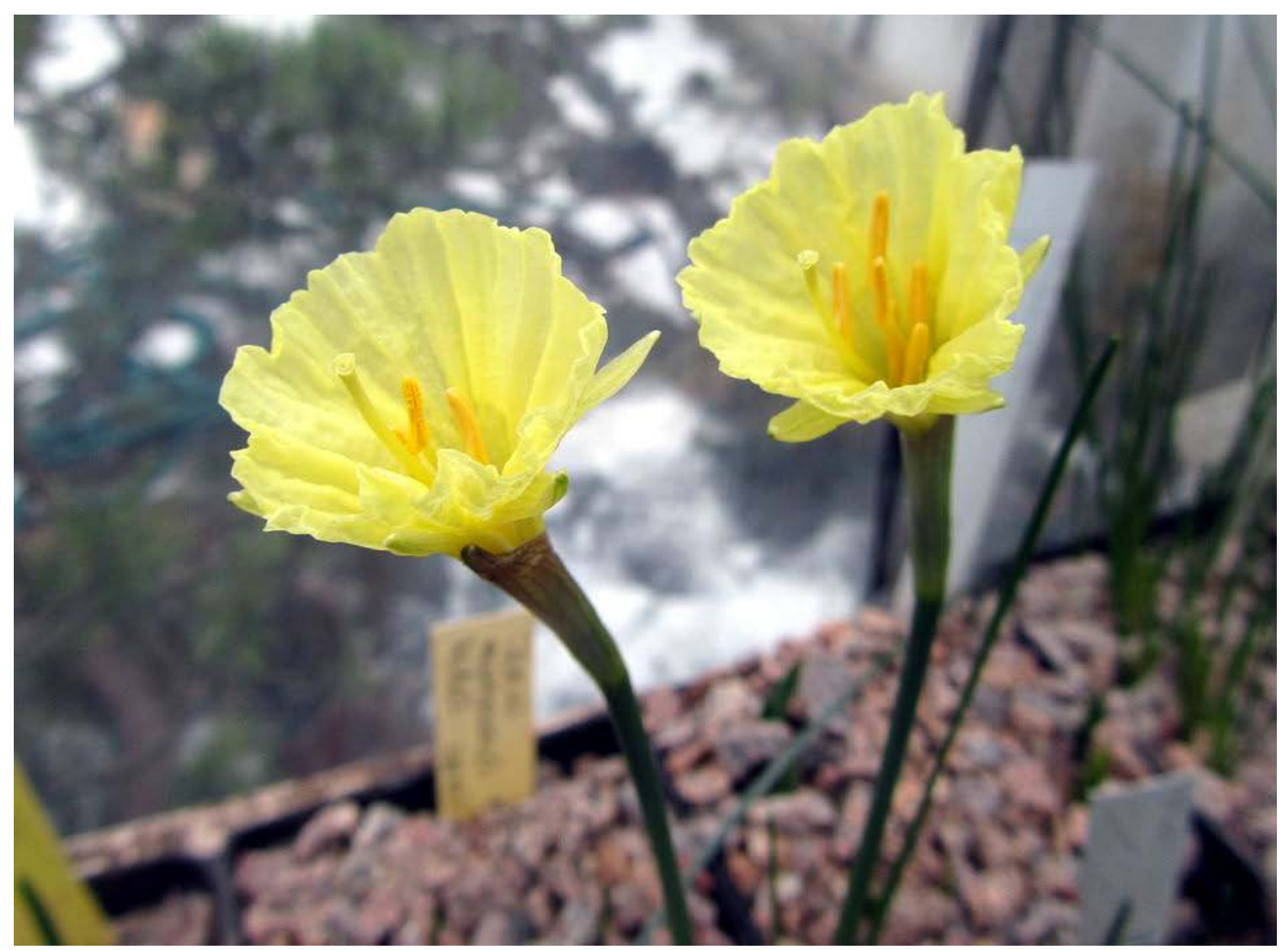
Narcissus romieuxii open pollinated seedling

Even during the heaviest snow falls areas at the base of the larger shrubs remain clear of snow. This illustrates well the 'rain shadow' effect caused by trees and shrubs. The dark areas without snow showing the zone that will remain drier as rain is also shed away from this area under the canopy. This area can be used to good advantage for planting bulbs that want a dryer summer rest.