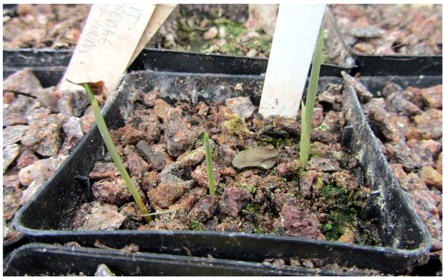
Shoots of Crocus michelsonii seedlings not yet mature enough to flower – hopefully with a good growing season and a feed of potassium (kalium) the first flowers could appear next year.